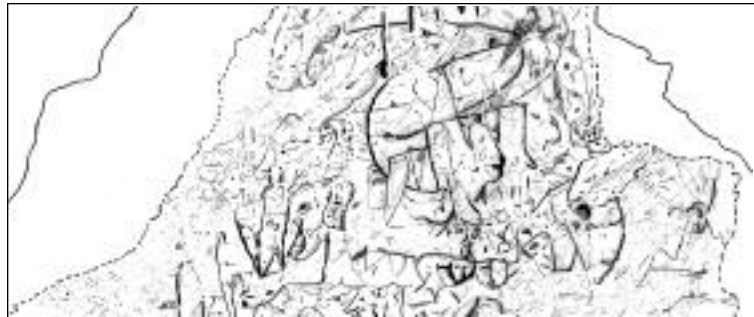
Scribed fragment of mastodon pelvis, showing a four-tusked mastodon and other animals. The bone was worked while it was still fresh. It was found in the 1950s, weathering from Valsequillo sediments 50 metres north of what later would be the main excavation trenches at Hueyatlatco.

Things are getting interesting. Stay tuned in!